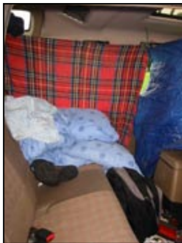
M1EQQ's NFD Bedroom